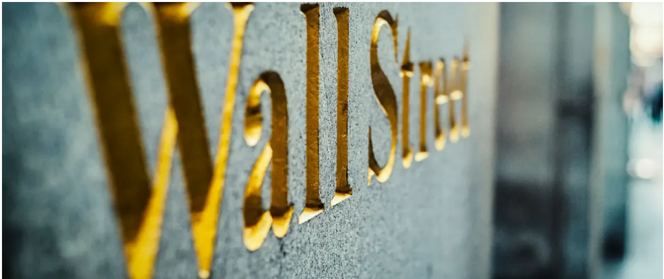
Engraved Wall Street sign, New York, USA

By JEFFREY J. WILLIAMS PUBLISHED AUGUST 14, 2021 10:00AM (EDT)