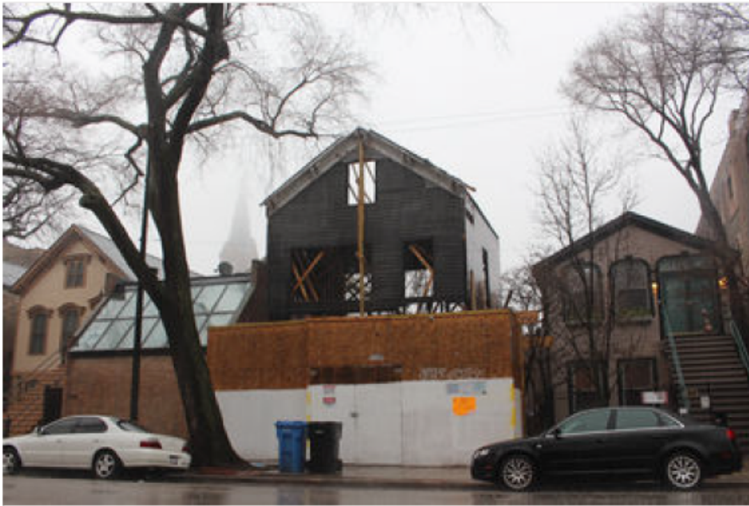
With the steeple of St. Michael's Roman Catholic Church in the background, the building at 1720 N. Sedgwick Ave. stands in the rain Thursday with no roof, no tarp and open walls.

By Ted Cox ( http://www.dnainfo.com/chicago/about-us/our-team/editorial-team/ted-cox ) | April 7, 2017 5:20am