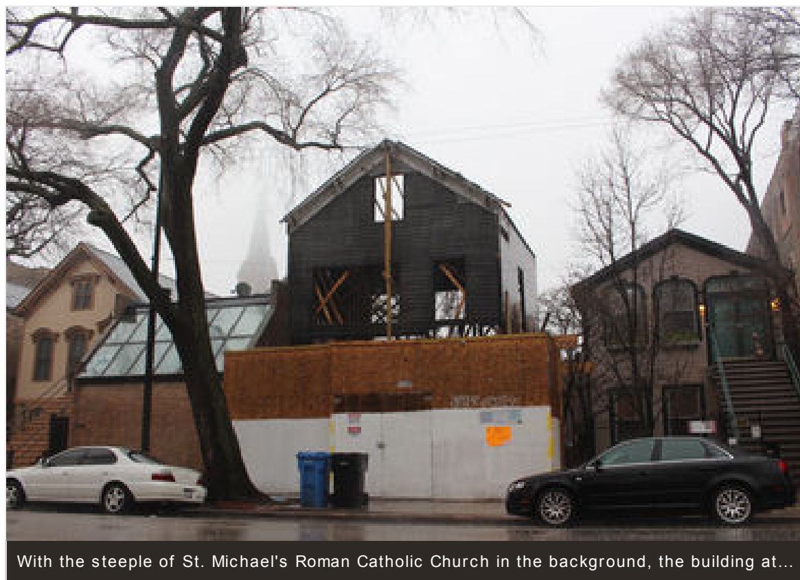
With the steeple of St. Michael's Roman Catholic Church in the background, the building at...