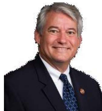
U.S. Rep. Dennis A. Ross representing Florida's 15 th Congressional district in Central Florida, including parts of Polk & Hillsborough counties