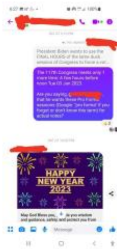
US_HOUSE_CALENDAR.jpg ~120 KB