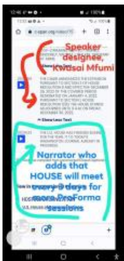
Screenshot_C-SPAN_20221230-004614.jpg ~140 KB