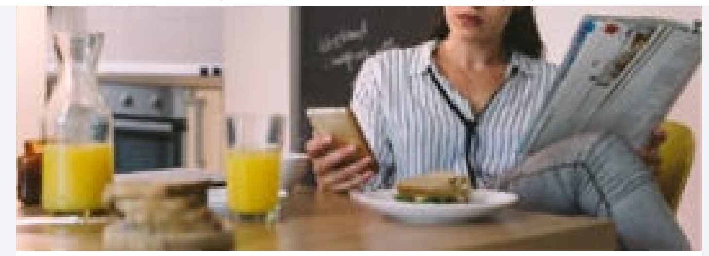
What to do if you can't pay your loans during the coronavirus crisis

Trump's Executive Orders Extend Student Loan Relief, With Some Exceptions | Bankrate