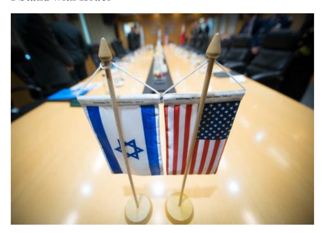
U.S. & Israel flags on a table during a meeting between Dept. of Defense and Israel Ministry of Defense officials.

As a sovereign state, Israel has every right and a duty to protect its people from attacks by Hamas, an Iranian-backed terrorist group. I believe it is critical that we stand with Israel, especially in the face of terrorism. That is why I took to the Floor of the House of Representatives to speak in support of one of our greatest allies.