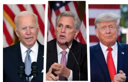
GOP looks to impeach as Trump's payback AMANDA MARCOTTE