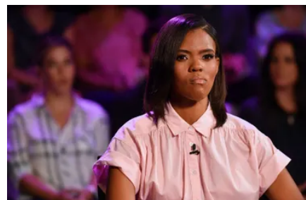
Candace Owens totally doesn't have COVID ZACHARY PETRIZZO