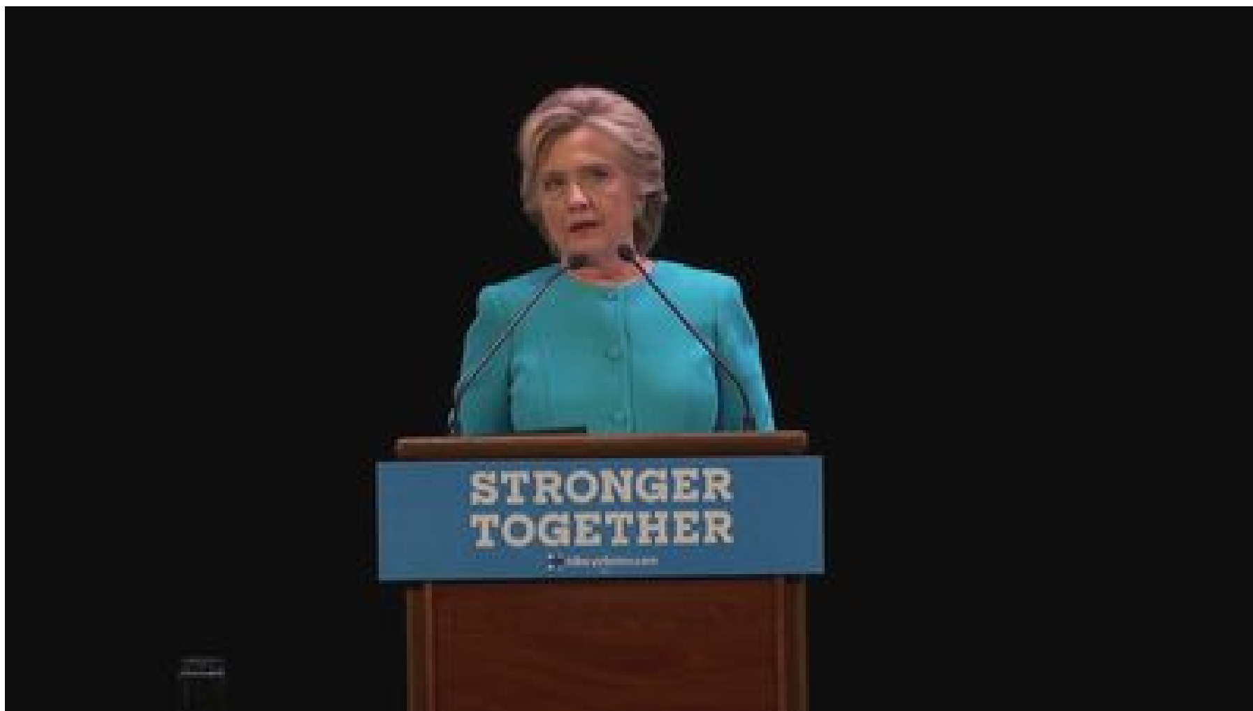
Hillary Clinton Says This Election Is 'Incredibly Painful'

( http://www.bloomberg.com/politics/articles/2015-10-07/hillary-clinton-s-fierce-gun-control-advocacy-marks-sea-change-for-democrats ) for gun control, including strengthening mandatory background checks and banning assault weapons.