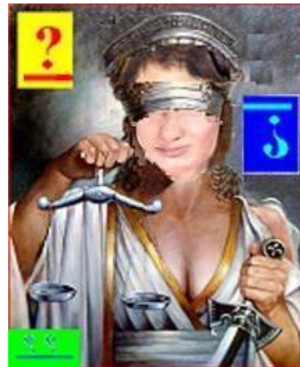
Lady Justice ponders: Will justice be served?

First, please cosponsor bills like H.R.3451, the Student Loan Bankruptcy Parity Act of 2015. (Actually, make college loans equal to Credit Card loans, which have ALL std consumer protections.) Then, please pass a bill reversing the obscene increases in College Loan limits in §422 of H.R.507 (109th CONGRESS), the “College Access and Opportunity Act of 2005,” a bill introduced by former speaker John Boehner, which was the cause of this crippling & massive college debt and benefited only the banks & universities. Boehner, an Establishment R.I.N.O. (Republican in Name Only), whose bill distorted the Free Market with increased subsidies, in the form of increased in taxpayer-backed college loans, regularly opposed Conservative Free Market checks/balances against predatory lending, tuition inflation, etc., and was rightly ousted as Speaker of the House. But, are the current 'Republicans' any better?