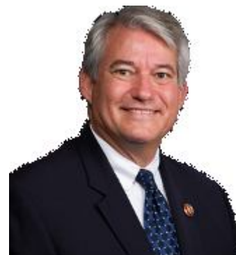
U.S. Rep. Dennis A. Ross representing Florida's 15 th Congressional district in Central Florida, including parts of Polk & Hillsborough counties