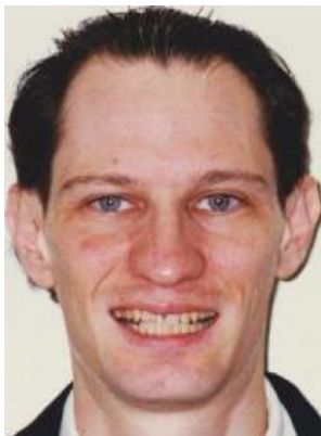
Gordon-profile-pic-SMILING-hi-rez.JPG ~14 KB