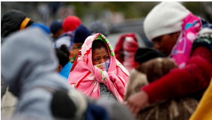
Asylum-seeking migrants stand covered with blankets during a day of high winds and low temperatures at a makeshift encampment near the

The timing of the release of the November border numbers, on the Friday before Christmas, irked some Republicans who have been critical of the way the Biden administration has handled the issue of immigration.