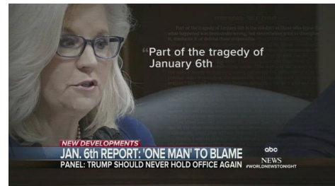
24/7 coverage of breaking news and live events

There were 233,740 migrants apprehended along the U.S. southern border in November, according to U.S. Customs and Border Protection- a 1% increase from October's record - breaking apprehensions and marked the highest ever number of border crossings ever recorded for the month of November.