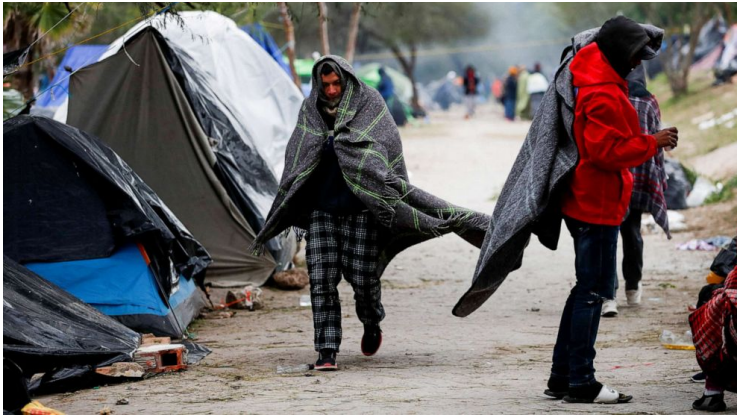
An asylum-seeking migrant walks covered with a blanket during a day of high winds and low temperatures at a makeshift encampment near