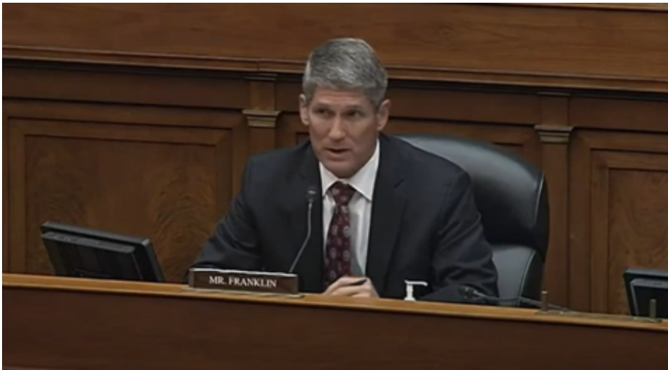
Rep. Scott Franklin questioning witnesses in a House Oversight Committee hearing

Ransomware attacks continue to spike across the United States. The perpetrators of these attacks target businesses and communities across the country, potentially costing our economy billions in lost revenue. As a member on the Oversight Committee, I questioned our nation's top cybersecurity officials on efforts protect our economic and national security. I'm working to protect businesses in Florida and working with our nation's top cyber security officials to ensure we have needed resources to thwart cyber threats.