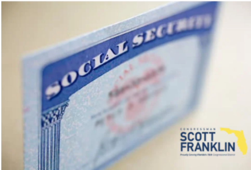
A copy of a social security card issued by the Social Security Administration