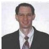
Gordon-profile-pic-CLASSIC-lo-rez.JPG ~2 KB