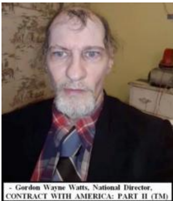
Gordon-hi-rez-pic-1.JPG ~42 KB