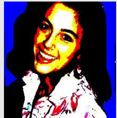
Terri Schiavo file photo