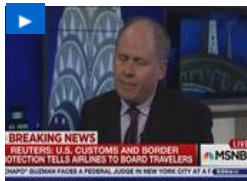
Last Word 2/3/17